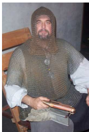
Medieval Knight, Book Faire

Russians in Early California – Hear about Fort Ross and the story of Nikolai and Concepción, the Mexican military governor's daughter. Learn the Russian Empire's role in California's European settlements. Tools, furs and parchment handouts are included in the presentation.