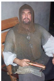
Medieval Knight, Book Faire

Russians in Early California – Hear about Fort Ross and the story of Nikolai and Concepción, the Mexican military governor's daughter. Learn the Russian Empire's role in California's European settlements. Tools, furs and parchment handouts are included in the presentation.