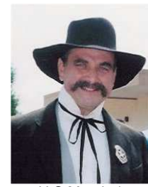
U.S. Marshal, Panorama, Arizona Territory