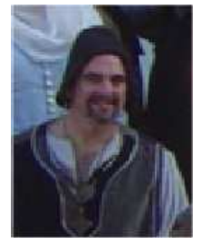
Medieval Barber, Camelot