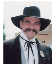
U.S. Marshal, Panorama, Arizona Territory