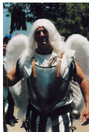
Saint Michael, Archangel Patron Saint of Battle