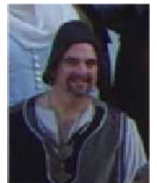
Medieval Barber, Camelot