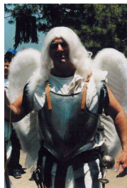
Saint Michael, Archangel Patron Saint of Battle