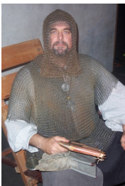
Medieval Knight, Book Faire