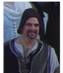
Medieval Barber, Camelot