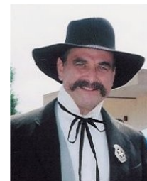
U.S. Marshal, Panorama, Arizona Territory