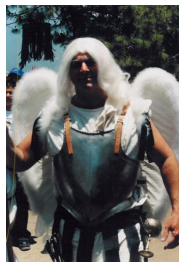
Saint Michael, Archangel Patron Saint of Battle