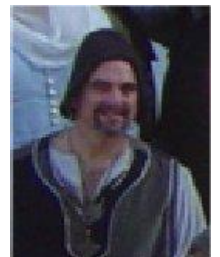
Medieval Barber, Camelot