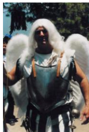
Saint Michael, Archangel Patron Saint of Battle