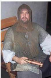
Medieval Knight, Book Faire