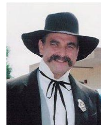
U.S. Marshal, Panorama, Arizona Territory